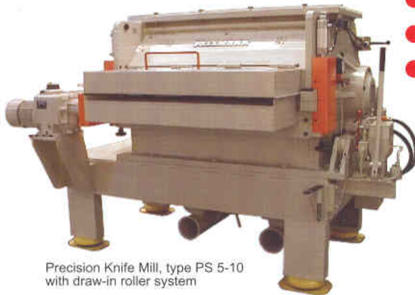
Precision Knife Mill, type PS 5-10 with draw-in roller system