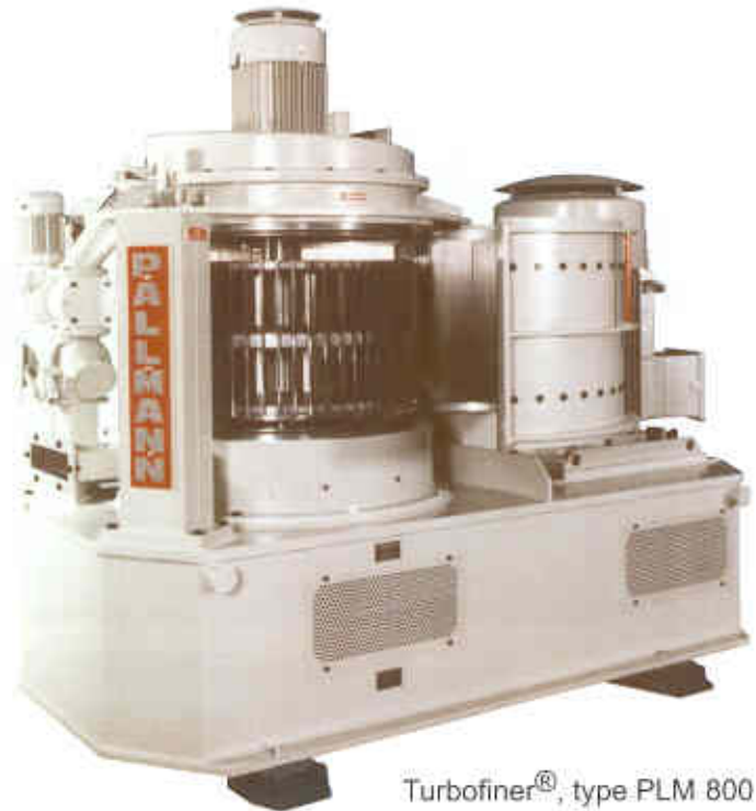
Turbofiner ® , type PLM 800

Contact us when you are looking for the best solution for your requirements.