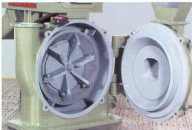
Turbo Mill, type PP 6S