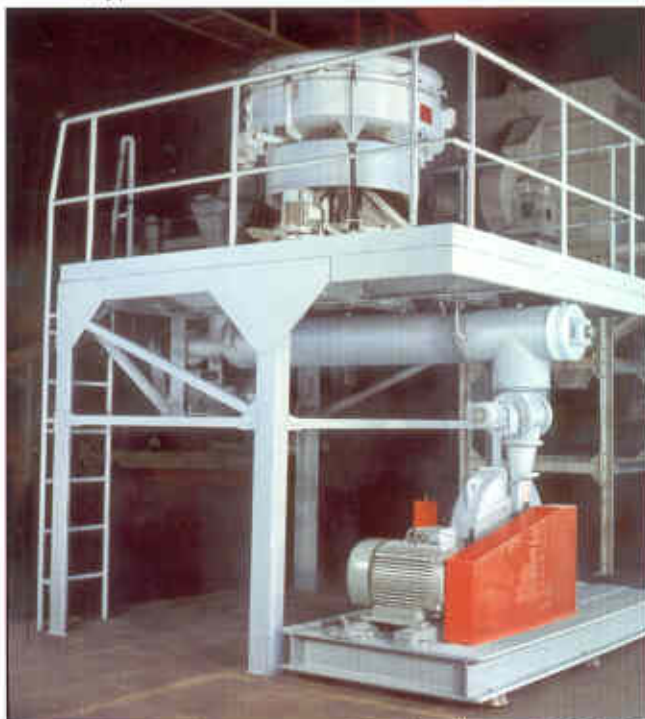
Cryogenic pulverizing system with pin mill, type PPST 400

Cryogenic pulverizing systems with inert gas atmosphere are used for extreme heat-sensitive materials as well as for obtaining an exceptionally high fineness.