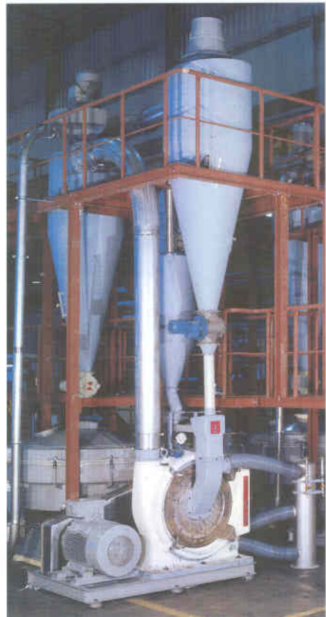
Grinding System with PKM 800