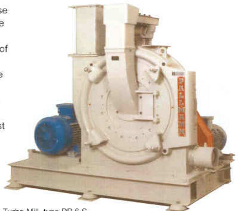
Turbo Mill, type PP 6 S