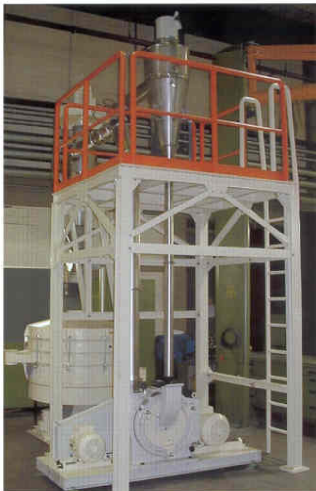
Pulverizing System, type PP 6S with tumble screen