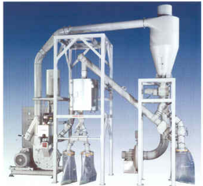
Pulverization System PKM 450 with screening