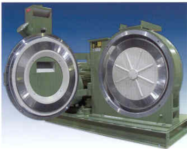
Disc mill, Type PKM 800