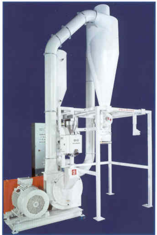
Standard Pulverizing System with PolyGrinder ® , type PKM 450 with metal separator