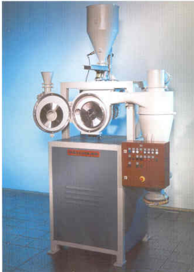
Pulverizing System with PM 300

Compound manufacturers, worldwide, produce high quality powders and granules with "ORIGINAL PALLMANN Pulverizing Systems for applications in injection moulding, extrusion and roto-moulding. Even heat-sensitive materials such as PS, PC, PA etc. can be processed under ambient temperature. The pulverizing system consists of only a few components with smooth surfaces. It can be easily dismantled and cleaned thoroughly.