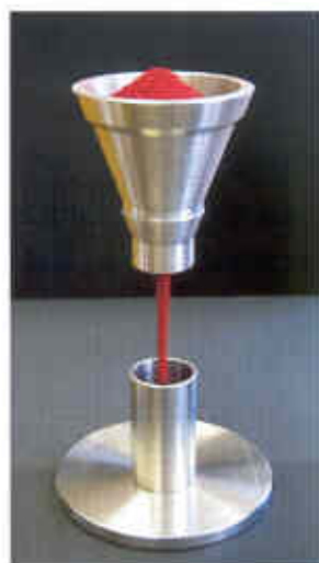
Flowability time and bulk density