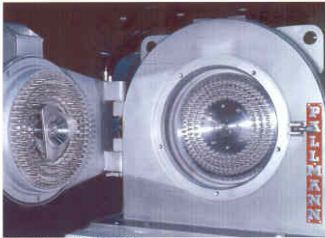
Pin mill, type PPST 400