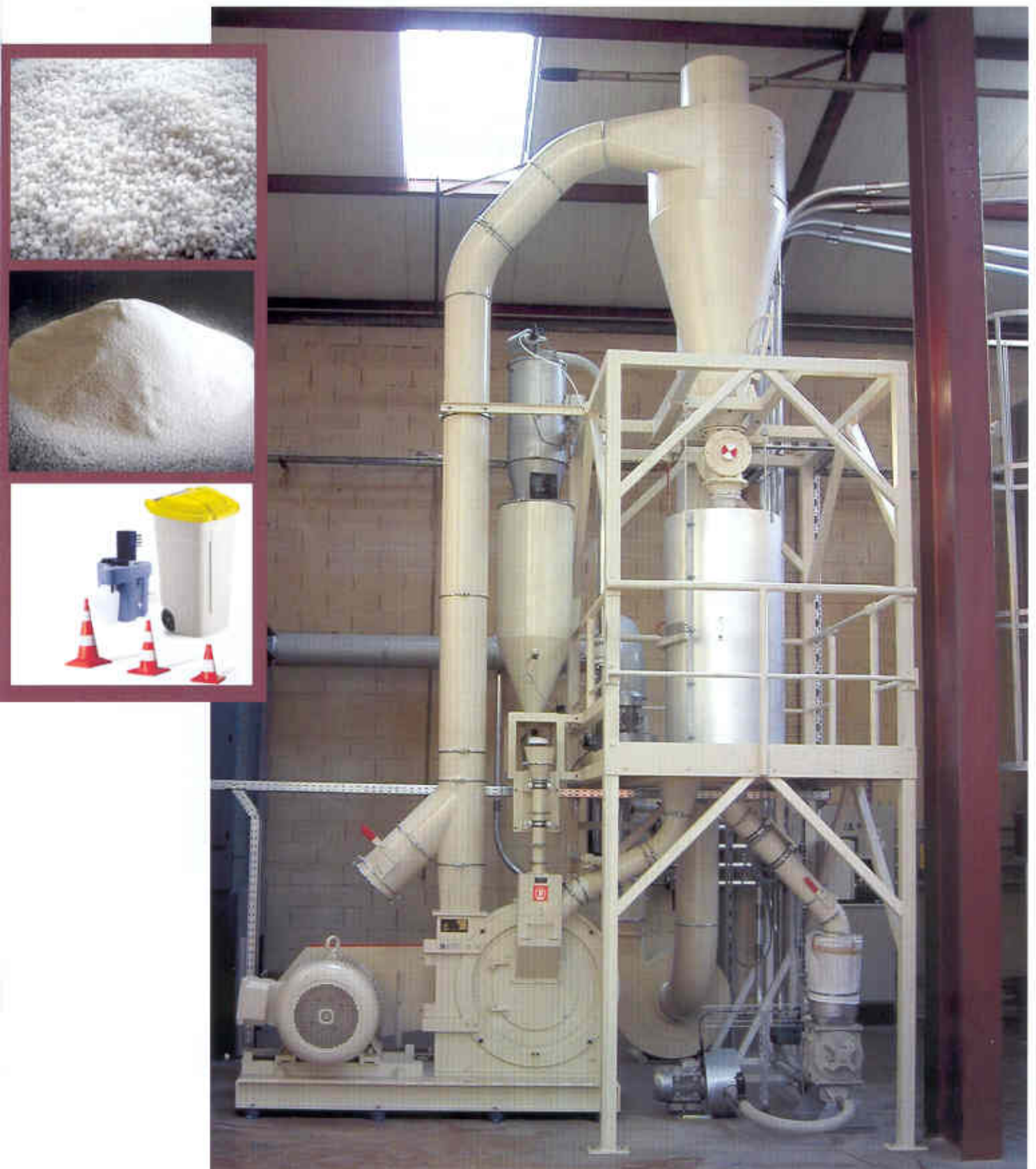
Grinding System with PolyGrinder ® , type PKM 800 and granule- and powder conveyor